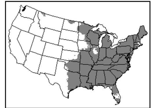
Ruby-Throated hummingbird range map